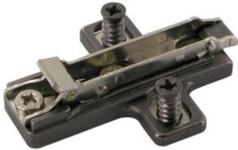
Plate Winged 2mm Titanium Euroscrew