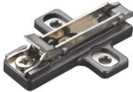
Plate Winged 2mm Titanium Screw-On