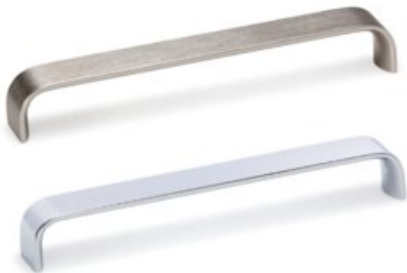
SENSE 0195