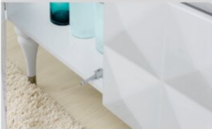
Magnetic Push Latches for Free-Swinging (Unsprung) Hinges