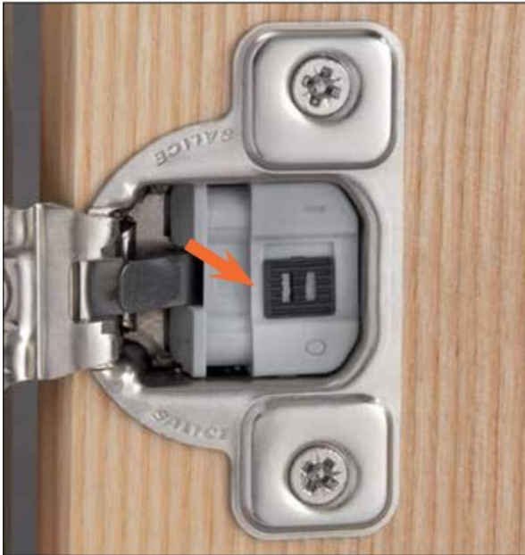
Switch dampening effect OFF by turning the lever to 0.