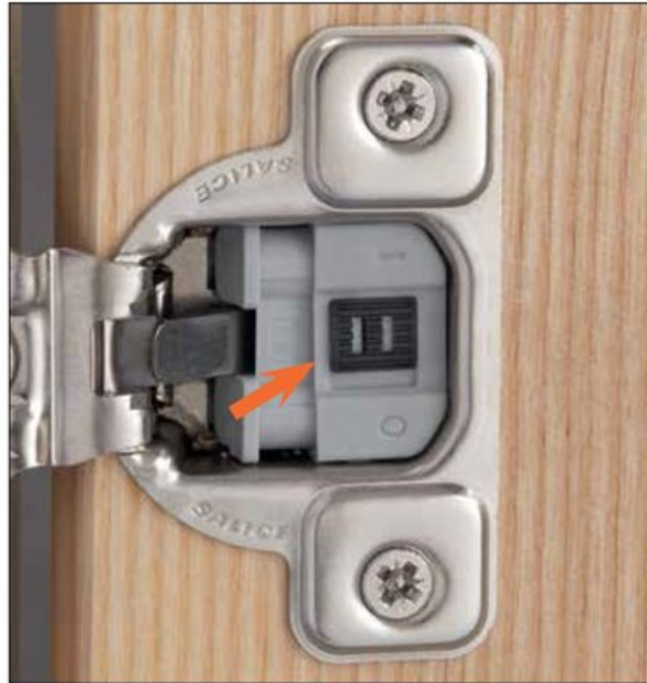
Switch dampening effect ON by turning the lever to I.

View this product online at https://marathonhardware.com/pd/SCUP37D9