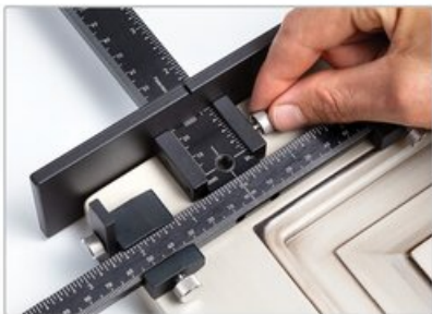
2 Adjust Location