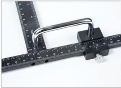
1 Set Hardware Spacing