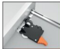
AFCGXX3B Standard mount - 6-way adjustable