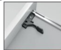
AFCEX56B Standard mount - 2-way clip, with side fixing

For any further information and requests: