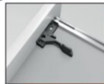
AFCEX56B Standard mount - 2-way clip, with side fixing

For any further information and requests: