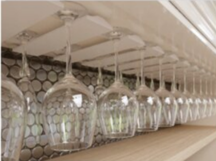
What's In the Box