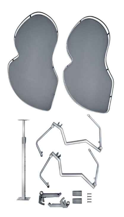
M-Series Swing Corner Left