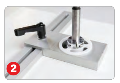
Drill light hole to desired depth using adjustable stop.