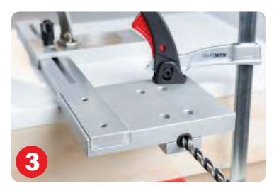
Leave clamps in place drill wire hole until bit reaches light hole.